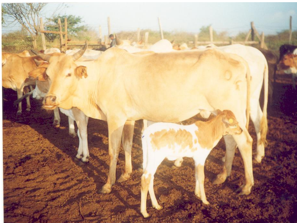
Plate 2 : A ‘traditional’ Zebu cow with a calf.

The photos below, taken during the study, show the traditional Zebu and the preferred Sahiwal breed.