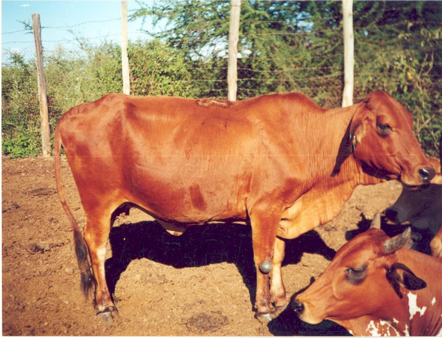
Plate 3: The Sahiwal breed of cattle.