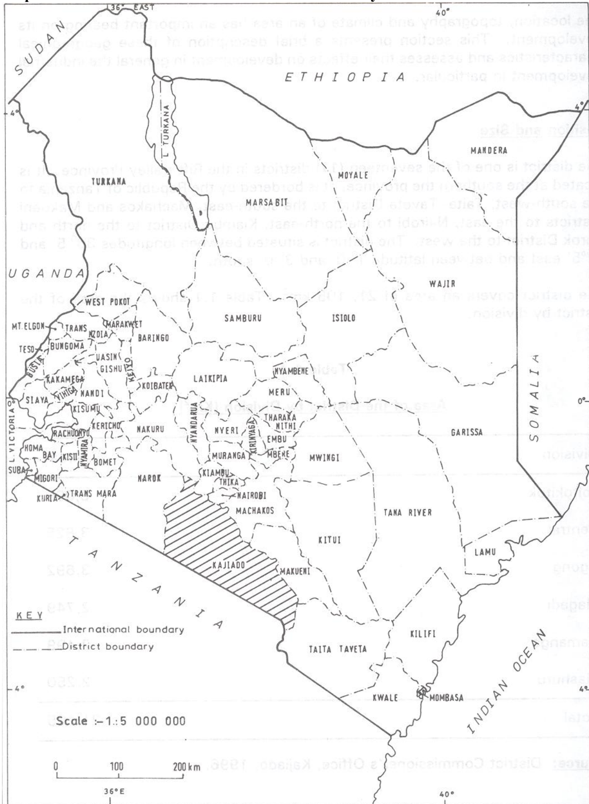
Map 1. The administrative and 'ethnic' districts of Kenya

Source: Republic of Kenya, 1997. Kajiado district is shaded, and adjacent to it is Makueni district. The Maasai inhabit Kajiado, Narok and Trans Mara districts while the Kamba native districts are Makueni, Machakos, Kitui and Mwingi.