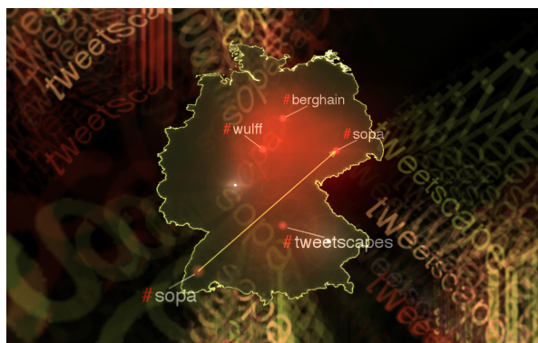
Figure 1: Screenshot of the #tweetscapes media stream at http://tweetscapes.de (2012-01-18): arrows show replies, #hashtags occur at the location of the tweet.

(e. g. temperature, humidity, precipitation, wind, etc.) and its expected change over time for the next 24 hours in a 12 seconds soundscape, tuned to convey quickly and without the detour via language processing a good impression of how the weather is going to be like. From that project we learned that sonification in radio faces the particular challenge that sound needs to be as self-explanatory as possible and that the sonifications will be heard in many different contexts such as in the car, during work, in noisy environments – which imposes specific constraints on the sonification design.