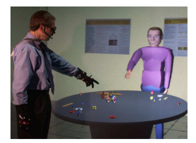
Fig. 1. The pointing game scenario: Comparable settings for empirical studies and VR

Intended empirical studies realized in this VR-setting are aimed at evaluating MAX capacity to interpret and generate situated co-verbal gesture and testing for the naturalness and acceptability of the simulation.