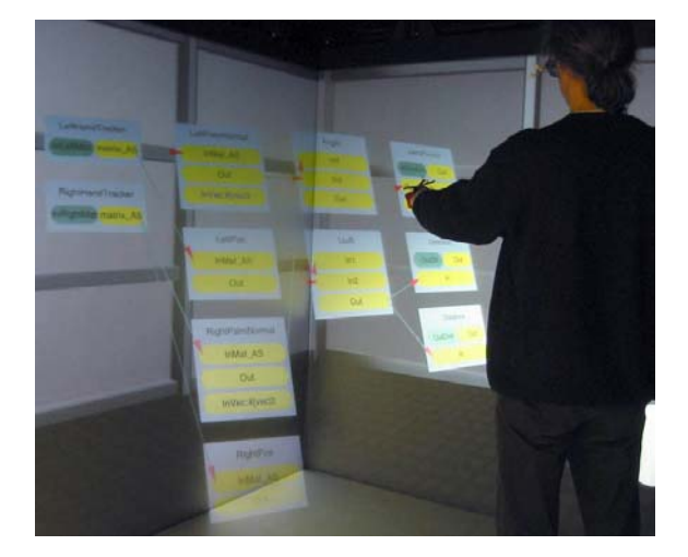
Fig.5: A simple visualization of a compute network. in a CAVE-like display system

Finally, it is possible to build a geometry for every computing node and arrange them in the scenegraph according to their field connections to get a complete visualization of the compute networks currently used.