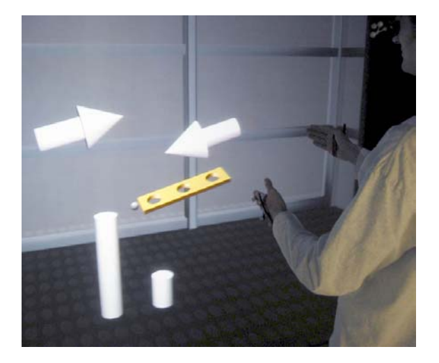
Fig. 4: A VR scene with different visualizations of field values.

Almost all field types can be visualized by special visualization nodes. Since all AVANGO field containers can be instantiated as dynamic coordinate systems and therefore be added to the existing scene-graph of the VR application, it is easy to generate nodes which generate their own geometry to visualize field-values. This visualization is shown directly in the virtual environment and is ideal for testing and debugging new compute networks, which work on user-input from tracking-devices or data-gloves, directly while interacting in the VR scene.