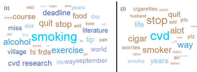
Fig. 2. Monthly keyphrases for 09/2013 (left); keyphrases related to "smoking" (right)

Content Evaluation and Planning. Monthly tag clouds and the ability to gather related keywords to a query term enable the user to evaluate existing content and reactions to the page owner's content. The monthly tag cloud in Fig. 2 (left) shows the page-triggered keyword "smoking" as the most important topic. Analyzing frequently co-occurring keyphrases for "smoking" (see Fig. 2, right) yields (i) semantically related terms like "quit", "cigar", "cvd" (cardiovascular disease) and (ii) keyphrases indicating a personal connection (e.g., "husband", "father", "worries"), both mostly user-triggered. Apparently, many users are focusing on personal, rather than professional, aspects of the domain. As an actionable conclusion, it might be of use to trigger more treatment-related topics in order to shift engagement from patients to professionals.