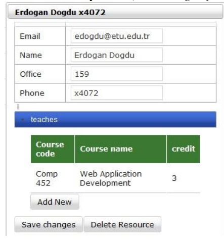
Figure 5. Relation Instance

Eventually a data element (faculty) is viewed in the single instance view as shown in Figure 5 with its data properties (email, name, office and phone) and object properties (faculty- teaches -course) altogether. In this case the inverse relationship instance is also automatically added (course- taughtby -faculty).