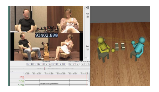
Figure 1: Scene from the Dream Apartment Corpus. The VR visualization shows the tracked body, (transparent) head, and gaze vectors

body at a sampling rate of 30 Hz, while the FaceLab data has twice that sampling rate (60 Hz).