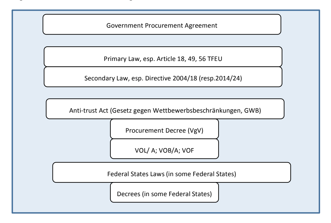
Figure 3: Public Procurement Regulations - a schematic outline

Notes: Without sector specific or defense regulations, regulation of concessions and budgetary law.