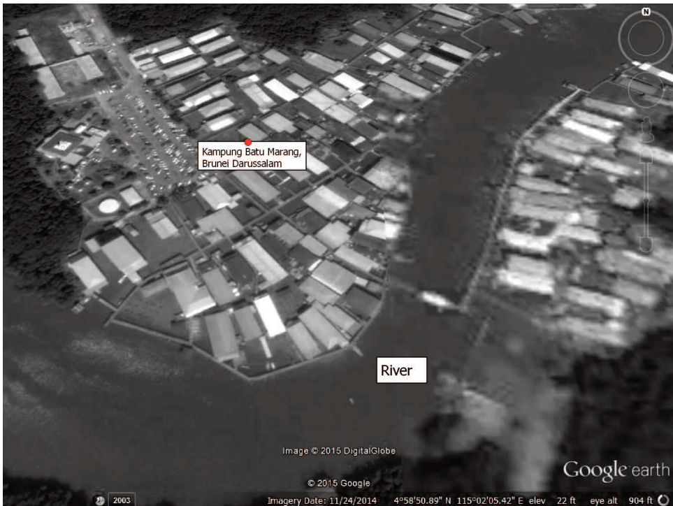
FIG. 2: Measuring the size of water villages (example from Labuan).

In order to measure the extent of water villages we have used remote sensing data, based on Google Earth and, occasionally, Landsat data. Polygons were drawn around the clearly visible water settlements around the coastline of Borneo, its major river estuaries and its islands and the number of houses counted (see Fig 2).