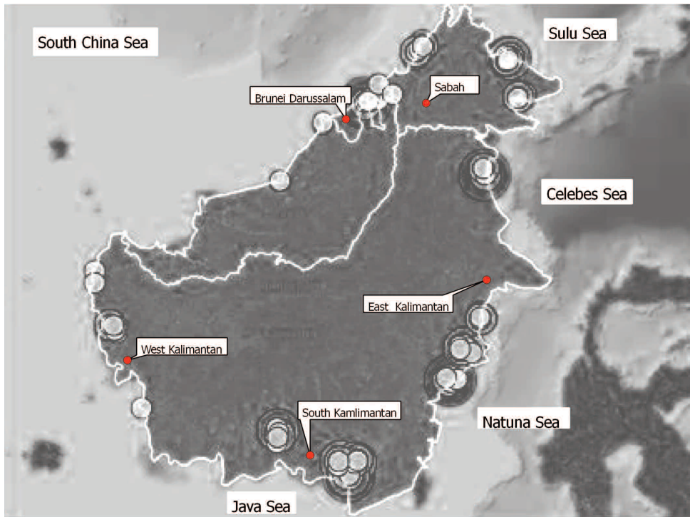
FIG. 3: Water villages around Borneo.