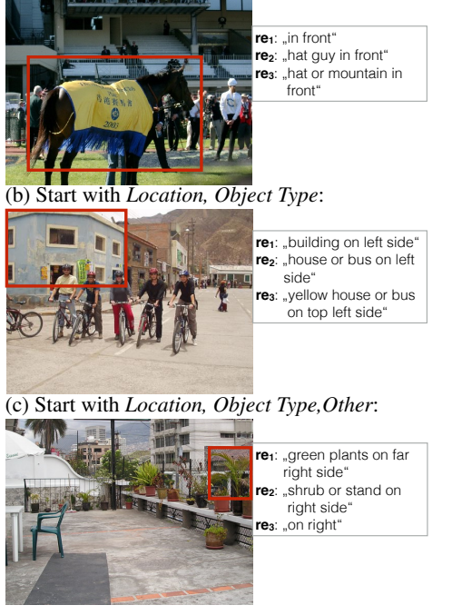
Figure 3: Examples for context-dependent installments

the pattern-based installment (Section 4.2) and the context-dependent installment strategy (Section 4.3). In this evaluation, we only use word classifiers trained on GoogLeNet features.