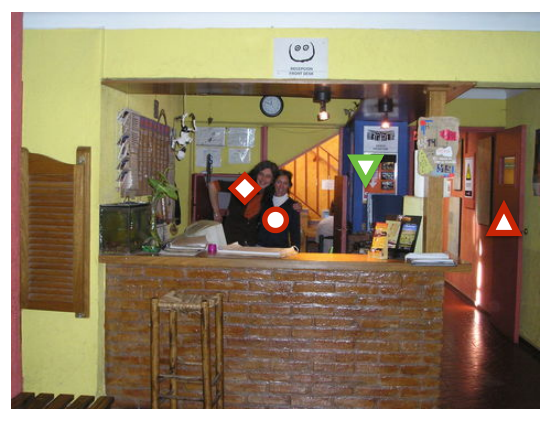
re <sub>generated</sub>: "person on the right" re <sub>human</sub>: "sign on the blue shelf in the back"

Moreover, we can compare the different distractor clicks with respect to their spatial distance