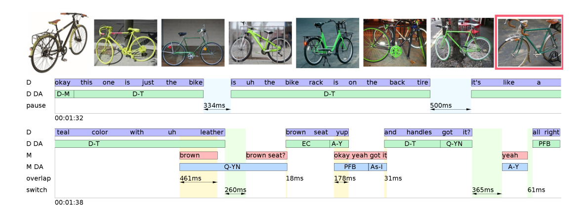
Figure 1: An example RDG-Image dialogue, where the director (D) tries to identify the target image, highlighted in red, to the matcher (M). The DAs of the director (D DA) and matcher (M DA) are indicated.

cific target image on the screen (outlined in red). When played by human players, as in Figure 1, the game creates a variety of fast-paced interaction patterns, such as question-answer exchanges. Our motivation is to eventually enable a future version of our automated RDG-Image agent (Paetzel et al., 2015) to participate in the most common interaction patterns in human-human gameplay. For example, in Figure 1, two fast-paced question-answer exchanges arise as the director D is describing the target image. In the first, the matcher M asks brown...brown seat? and receives an almost immediate answer brown seat yup. A moment later, the director continues the description with and handles got it?, both adding and handles and also asking got it? without an intervening pause. We believe that an important step toward automating such fast-paced exchanges is to create an ability for an automated agent to incrementally recognize the various DAs, such as yes-no questions (Q-YN), target descriptions (D-T), and yes answers (A-Y) in real-time as they are happening.