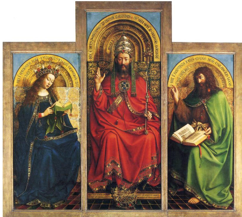
Figure 2 Deesis [Inner upper panel of the Ghent altarpiece], 1432, oil on wood. Ghent, Sint-Baafskathedraal.

dans l'exécution des petites figures de la composition'. Almost a century later, Dvořák sought to break with the evolutionary concept of De Bast, Waagen and others, but reached more or less the same conclusion by conjecturing a dialectical idea of classicism vs. anticlassicism: '(...) the eyes [of the Ghent Deity] are empty and without soul; they do not look, they stare (...) How boring and scholastic the classicistic, almond-shaped eyes appear in contrast to the ever-changing variations by Jan'. 55 The author needs to appreciate certain parts of the altarpiece, and depreciate others, in order to develop an argument for an innovative naturalism. Quite possibly, the scholastic and classicistic convictions presented here even resonate with the spirit of his time, seeing as anticlassical tendencies such as impressionism became more and more widespread after 1900. A few years later, Hermann Beenken proposed an entirely different approach: