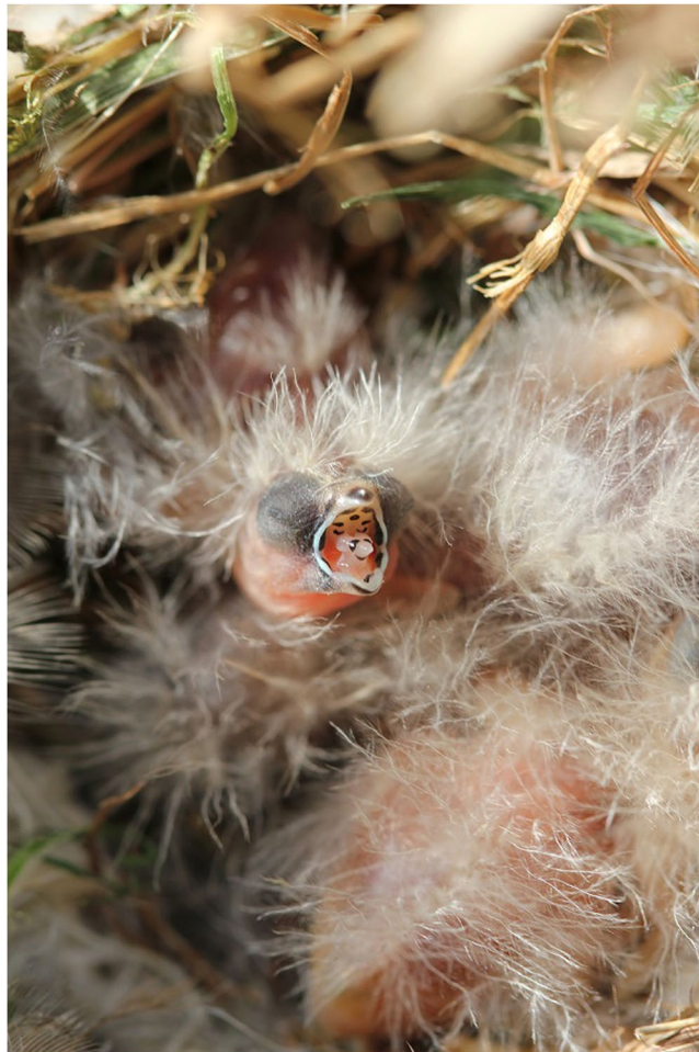
Figure 1. Day-old Zebra Finch chick in its nest, showing stereotypical begging behaviour. The eyes remain closed until about seven days old.

(non-social) odours at an early developmental stage 19–24 . Akin to mammals 25 , olfactory sensory neurons of domestic chicks ( Gallus gallus domesticus ) are also fully functional within the egg six days prior to air-breathing 26 , enabling odour learning in ovo 27 . Recent studies of Zebra Finches provide further evidence of odour learning close to hatching 28 .