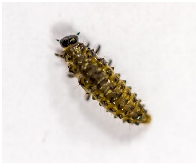
FIGURE 1 Phaedon cochleariae, mustard leaf beetle (Coleoptera: Chrysomelidae), larvae in the third (last) larval stage