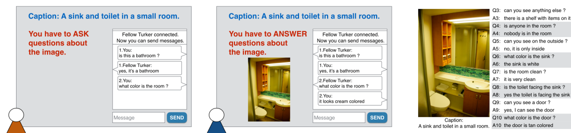
Figure 1: The Visual Dialogue Collection Task and an Example Dialogue (from (Das et al., 2017))

Figure 1 shows the environment in which the visual dialogue dataset (Das et al., 2017) was collected. As the example dialogue on the right indicates, this rather artificial setting (“you have to ask questions about the image”) seem to encourage a pairwise structuring of question and answer. That the string of pairs forms a dialogue is only recognisable in the fact that each pair concerns a different aspect of the image, and that later questions may refer to entities previously mentioned. Since there is no way for the questioner to provide feedback on the answers, it is unlikely that a model could learn from data of this type that dialogue is more than a sequence of loosely related question/answer pairs, and that even such sequences typically would have structure in human dialogue. (For reasons of space, we cannot argue this point more deeply here.)