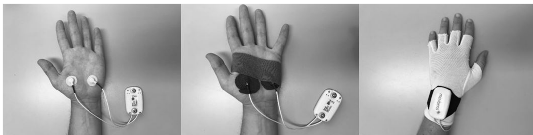
Figure 1. Movisens EdaMove 3 set-up.

5 p.m. Triggers were sent at least 15 minutes apart, and participants would receive a maximum of five random triggered questionnaires. For triggers based on skin conductance, real-time skin conductance scores were averaged across one minute (i.e. SCL) and compared with SCL scores of the minute before that. If the relative increase surpassed a threshold that was set at the start of the day (see below) a trigger was sent to the smartphone. To control for influences of physical activity, we suppressed triggers when SCL increases accompanied increases in step count, which is an established procedure (Myrtek, Aschenbrenner, & Brügger, 2005).