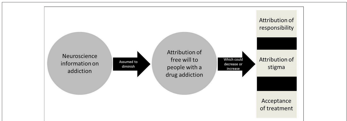
FIGURE 1 | Impact of neuroscience information of attribution of free will.

Neuroscience information on addiction and attribution of free will: Has now been generated as a result of the intensification of research activities on this topic in neuroscience. The implications of this research could be manifold, including for the basic understanding of the mechanisms of addiction, the development of treatment as well as prevention and policy (Dackis and O'Brien, 2005).