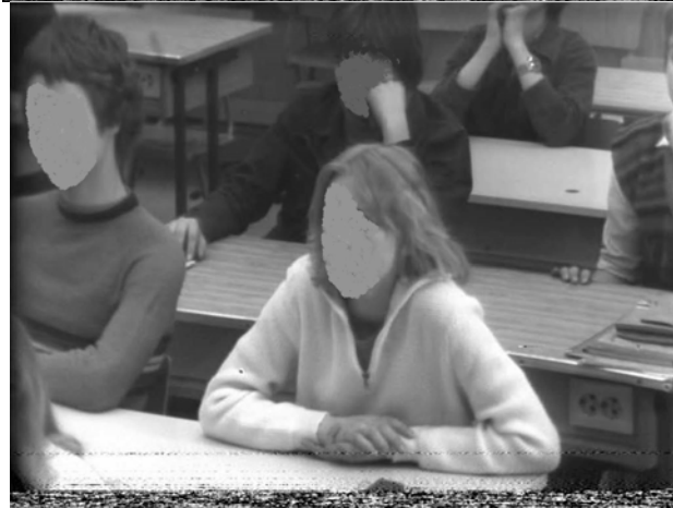
Camera perspectives (from top down): 'class', 'chalkboard', 'partial'