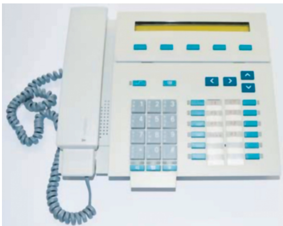
Fig. 4: Octophon 86.

The Mickey Mouse Telephone with its old technology vanished from the markets when digital networks were implemented at the end of the 1980s. A new generation of fully digital ISDN phones such as the 'Octophon 86', which offered a large number of