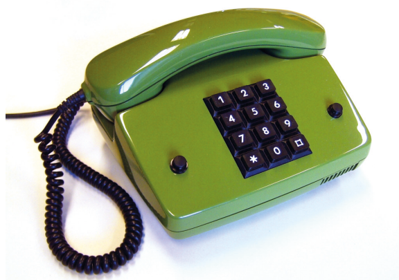
Fig. 2: Fernsprechtischapparat 75.

The Bundespost organised the services and the production of all necessary equipment. Phones, cables, amplifiers etc. were produced or supplied by a strictly limited number of companies such as Siemens or Telefunken. In most cases, customers could only buy or hire their equipment from the Bundespost which at the same time formed cartels with national equipment producers. In the 1960s and 1970s, these cartels gained in strength due to an enormous increase in the number of private phone connections and a growing range of equipment. The 'Fernsprechtischapparat 75'—a standard model offered by the Deutsche Bundespost—was adopted by millions of private households nationwide. It was a symbol of uniformity and limited choice at a time when individual expression, individual lifestyles and the freedom of choice increased in importance in German society. The Keynesian understanding of the relationship between the state, the economy and society is reflected in the design of phone models in the 1970s.