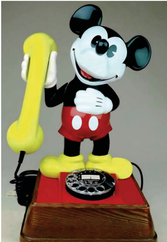
Fig. 1: Mickey Mouse Telephone.

tions. The price was several times higher than for a standard phone offered by the Bundespost.