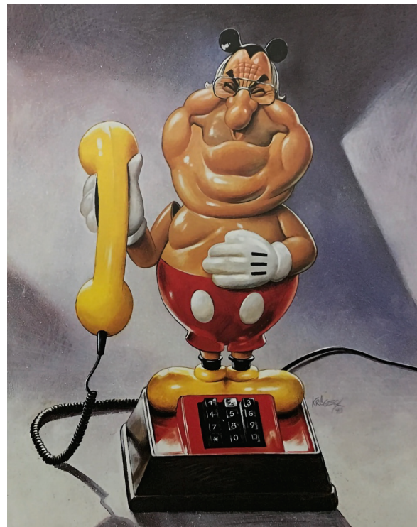
Fig. 5: Cartoon Kohl as Mickey Mouse Telephone.

From 1990, the Mickey Mouse Telephone was no longer discussed as a symbol of the monopolistic telecommunication market or of outdated technology, half-hearted liberalisation and uniformity. It became a cult object and remained a fascinating collectable for the next decades. Ten years after being introduced in the German market, the widely known icon was the inspiration for a parody created by the famous German cartoonist Sebastian Krüger in 'Endlich! Kohl nimmt ab!' (Finally! Kohl picks up the phone/sheds weight!), published in the journal Kowalski in 1990. 58 Remarkably, Krüger's intention was not to portray telecommunication or regulatory policy, but to deride the German Chancellor's at-