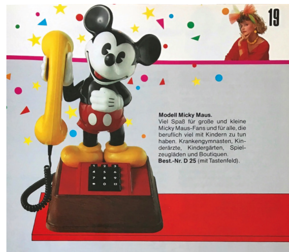
Fig. 3: Advertisement catalogue of the Bundespost in the 1980s.

Introduced by the Bundespost in June 1980, the Mickey Mouse Telephone proved to be the most important telephone within the extended offer in terms of distribution, societal significance and representation of the zeitgeist. The phone, officially named DFeAp 322 by the Bundespost, therefore embodied the tensions between the neoliberal and the Keynesian state-centred style of regulation in the telecommunication sector, the tensions within society between sociocultural norms of conformity and individualism or freedom of choice, and the tensions between the old analogue technology and the promises of digital communication. 43 The Mickey Mouse Telephone was an icon of 'individualistic' US culture, reflecting society's needs, desires and values in the early 1980s. 44 Therefore it seemed the perfect choice for the Bundespost and the intended purpose of the series of design phones. The model was advertised as fun for young and old Mickey Mouse fans and a 'must have' for all those working professionally with children. 45