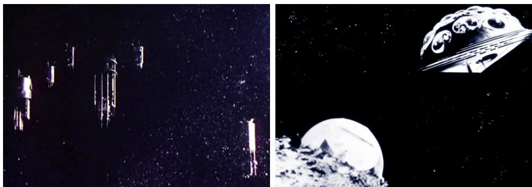
Figure 1: Depictions of spaceships from Der Große Verhau

To be sure, Die Ungläubige does not function on the overt and complex allegorical level of Die Artisten in dealing with the obstacles to the production of a revolutionary, utopian cinema. At the same time, however, and in a different manner than Die Artisten , Kluge's science fiction mines a specific aesthetic. A look forward to Kluge's later full-length sci-fi films Der Große Verhau (1969) and Willi Tobler und der Untergang der 6. Flotte (1971) can provide some insight into this sci-fi aesthetic. These films, which are characterized by what Miriam Hansen calls »deliberately dilettante trick photography«, reflect the influence of Georges Méliès on Kluge's conception of science fiction. 25 In addition to the amateurish trick photography, Kluge's work is characterized by the frequent use of intertitles, montages of crude drawings and photographs, and spaceships and space stations constructed out of spare parts from television sets (see figures 1 and 2).