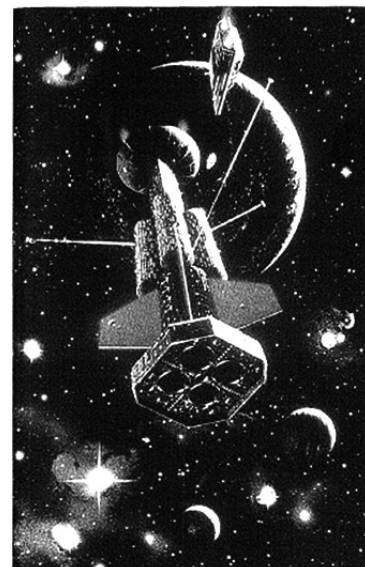
Figure 4: Opening picture from Öffentlichkeit und Erfahrung

Outer space is thus a realm of excess(ive) capital, the space into which it indefinitely and incessantly expands outside of its terrestrial boundaries. At the same time, the outer space of capital and its earthly reality are the same things that organize and ground the fantasy of science fiction, keeping it from spinning out of control and losing any bearing on reality. Thus, while Lewandowski, in line with Friedrich and Nagl, asserts that Kluge's science fiction differs from its affirmative counterparts that rely on a confirmation of the status quo (morally, technologically, and economically), it is by virtue of the inherent conformism associated with the genre that Kluge's science fiction is able to perform a critique. In this way Die Ungläubige , as a work of science fiction, both differs from and engages in dialogue with Die Artisten . »Die Schwierigkeiten der Kunstproduktion im Kapitalismus«, Lewandowski remarks about Die Artisten , »liegen aber nicht nur in der finanziellen Abhängigkeit des Künstlers, das wäre zu einfach gesehen, sondern auch in Momenten der Kunst selbst«. 38 That is, the latent contradictions and difficulties of artistic production under capitalism do not merely manifest themselves as financial impediments but materialize in the artwork itself. This is the case with Die Ungläubige as well. As a work of science fiction, it is haunted both by the failed possibilities of its early origins and by the later