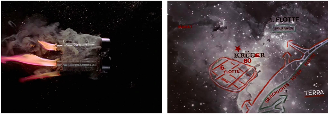
Figure 2: Stills from Willi Tobler und der Untergang der 6. Flotte

It is Méliès' early films, particularly Le voyage dans la lune (1902), rather than the grandiose production of the seminal science fiction film of the late 1960s – Stanley Kubrick's 2001: A Space Odyssey (1968) – to which Kluge's science fiction is indebted (see figure 3). 26