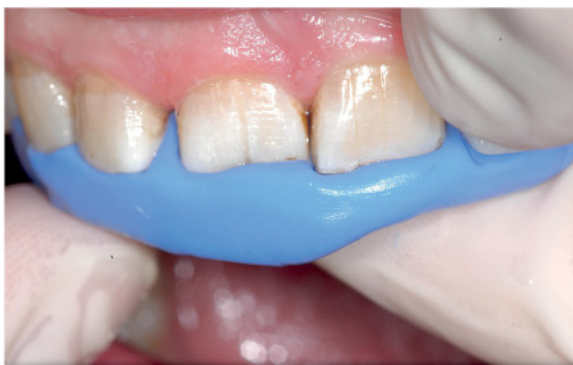
Figure 2 Restored coronal fracture line and silicone key prior to intentional extraction.

Under rubber dam isolation the coronal fracture line was enlarged with a small diamond bur. Additionally, 2/3 of the existing root canal filling was removed. The tooth was then stabilized coronally and intracanalary with a dentine adhesive (OptiBond All-In-One; Kerr, Orange, USA) and a composite restoration (Grandio/Grandio Flow; VOCO, Cuxhaven, Germany) (Figure 2). After removing the rubber dam and producing a silicon key (Figure 2), a titanium trauma splint (TTS; Medartis, Basel, Switzerland) was adapted and the area was anaesthetized with Ultracain D-