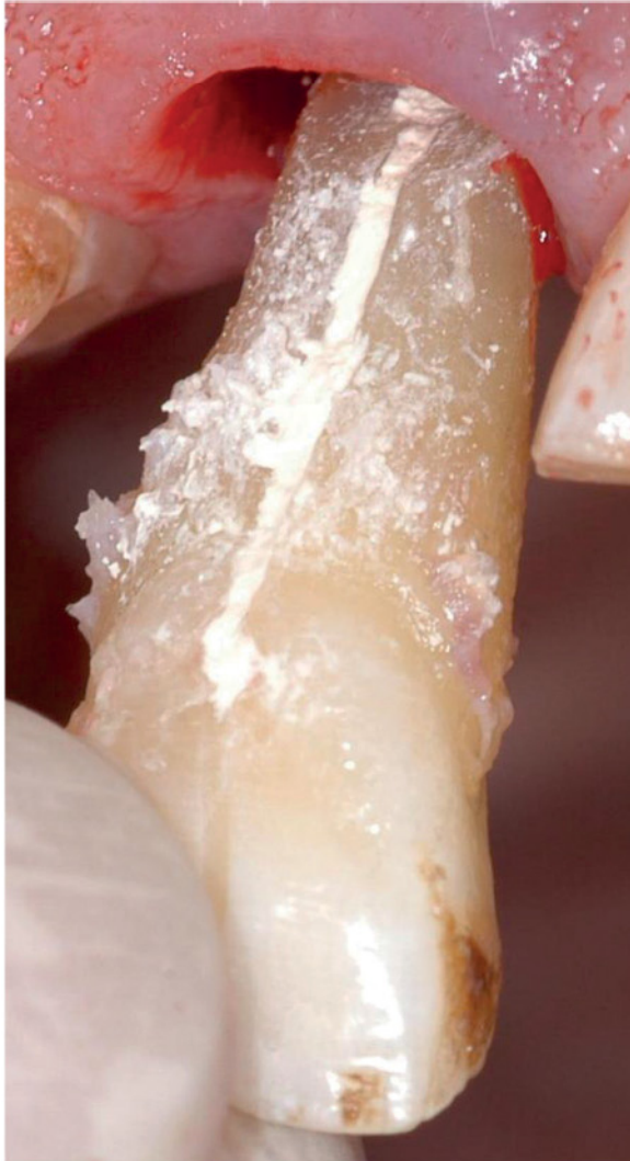
Figure 4 Enlarged fracture line filled with Biodentine (Septodont, St. Maur, France) prior to replantation.