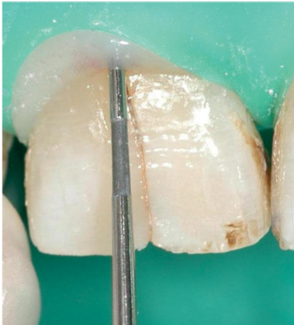
Figure 1 Fracture line on the labial surface of tooth 11 and periodontal probing depth of 7 mm in the area of the VRF.

options found acceptance by the patient (because of financial or comfort issues). So an alternative and new idea of treating the VRF was discussed, which the patient endorsed.