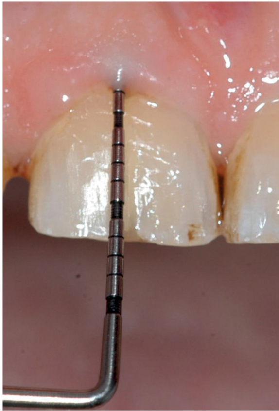
Figure 7 Periodontal probing depth of 3 mm in the area of the VRF 3 months after operation.