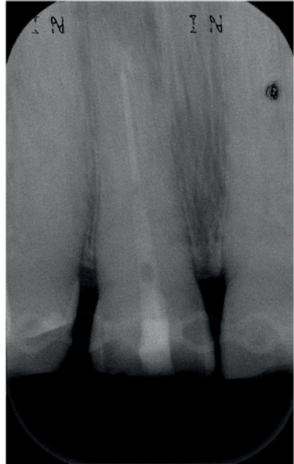
Figure 6 Control radiograph of tooth 11 after replantation.

over the whole period of time. The dental film recorded 24 months after intentional extraction and replantation does not show any pathological findings on tooth 11 (Figure 8).