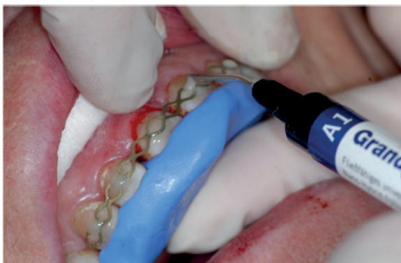
Figure 5 Replanted tooth 11 with silicone key for correct reposition and application of the titan trauma splint (TTS; Medartis, Basel, Switzerland).