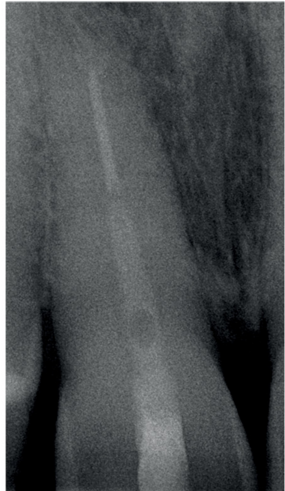
Figure 8 Control radiograph of tooth 11 24 months after replantation.

closure of radicular perforations and other dentine defects in the root [22-24]. Hence, the attempt to repair VRF with MTA has been described previously [4,17-19]. Even though ProRoot MTA has many positive features, it also has several drawbacks: difficult handling, long setting time, possible discoloration if used in the visible crown area, lower compressive and flexural strength than dentine (should not be used as a restorative base) and its high costs [25-28]. Thus, over the last years, several calcium silicate cements comparable to MTA have been presented, which can be used as endodontic repair material. One of these materials is Biodentine. It is a bioactive cement mainly consisting of tri- and dicalcium-silicate. When using Biodentine in the repair of VRF it may have some advantages compared to MTA. At first the initial setting time is about 15 min [28,29]. Even though Grech et al. evaluated the definite setting time of Biodentine to be 45 min (according to ISO 9917-1:2007) [30], this is much faster than the mean setting time for ProRoot MTA with 165 \pm 5 min [31]. Fast setting time is important for the suggested treatment option to keep the extraoral time short to avoid drying of the PDL cells and to provide a resistant filling when replanting the tooth.