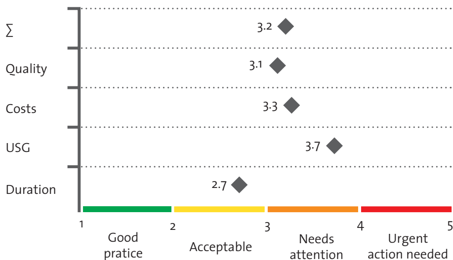
Figure 4 The risk exposure index (REI) is used to create a risk threat potential (RTP) which shows the impact of a particular risk on the whole turnaround in Euro.