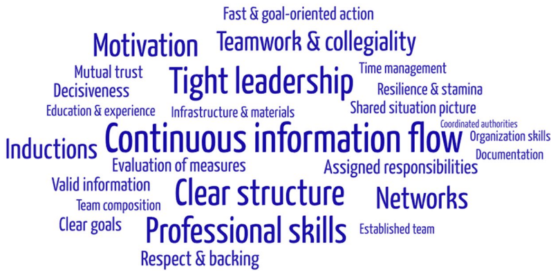
FIGURE 3. Success factors mentioned by the participants (based on 100 answers to the question about success factors). The font size is proportional to the number of mentions (Min = 3, Max = 20). [Colour figure can be viewed at wileyonlinelibrary.com ]