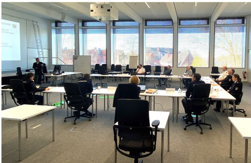
FIGURE 2. Illustration of increased space requirements of a COVID-19 CMT due to spatial distancing rules. [Colour figure can be viewed at wileyonlinelibrary.com ]

situation ( M = 2.67 , SD = 0.99 , Min = 1 , Max = 5 ). To investigate demands and resources in detail, we examined questions from the interview section on working conditions.