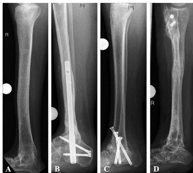
Figure 1. Different etiologies of ankle and hindfoot fusion in patients who were considered for tibial lengthening with retrograde ILN: A—congenital ankylosis (Patient No. 9), B—post tumor resection, subsequent segment transport, and docking with hindfoot nail (Patient No. 1), C—corrected deformity with screw arthrodesis in congenital clubfoot (Patient No. 2), D—fusion achieved with prior external fixation in tibial hemimelia (Patient No. 8).

The mean age at the date of ILN implantation was 18 years (13–25). The planned distraction distance averaged 49 mm (26–80) and thus was 9.0 mm (0–22) shorter than the LLD (Table 2).