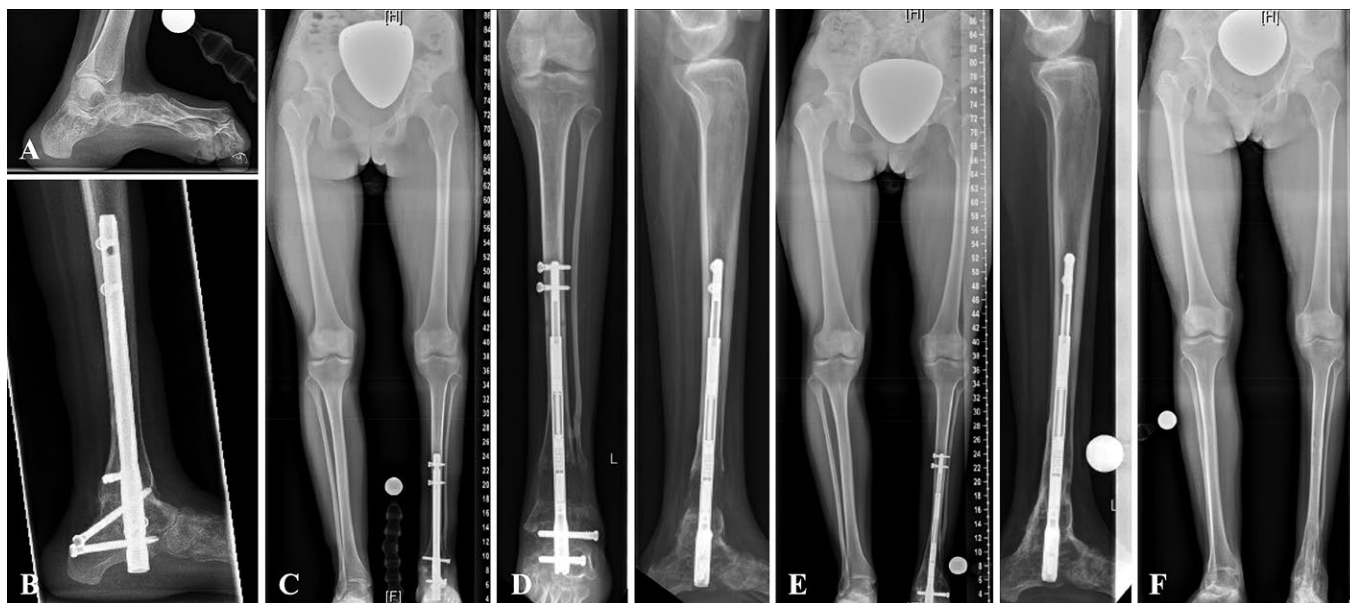
Figure 3. A—Patient No. 3 with pes calcaneus and leg shortening due to caudal regression syndrome. B—Prior to lengthening the foot deformity was corrected by ankle and subtalar arthrodesis using a retrograde nail. C—After ankle and hindfoot fusion the residual LLD measured 38 mm. D—Tibial distraction osteogenesis of 31 mm using a retrograde magnetically driven ILN. E—Postoperative long standing radiograph after full consolidation. F—Postoperative long standing radiograph after ILN removal 26 months postoperatively showing intended residual LLD of 7 mm.